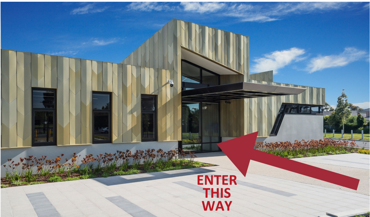
Cardinia Cultural Centre - 40 Lakeside Boulevard, Pakenham VIC 3810